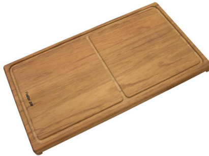
Iroko-wood sliding chopping board