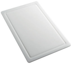
HPDE Chopping board