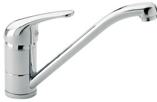
Mixer Tap S1000 - RO