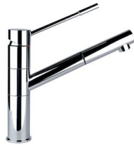
Mixer Tap Lorenzo 8466 000