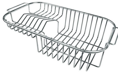
Stainless steel plate rack 8100 301