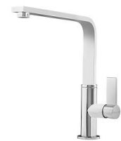
Mixer Tap NYC 8486 000