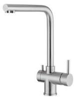
Mixer Tap Gamma 3 vie - satin 8496 100